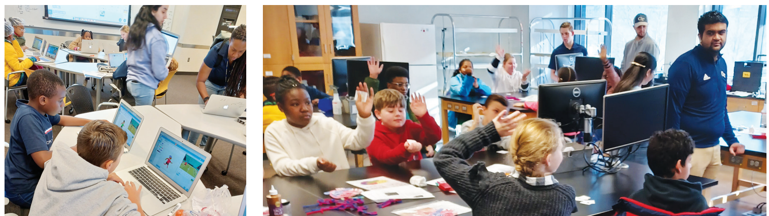
Students from four DCSS schools, LSHS, SDES, MAES, and HSES, recently participated in a Saturday program offered by Georgia Tech's Center for Education Intergrating Science, Mathematics, and Computing (CEISMC) in Atlanta.